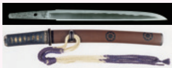
National Treasure Tantō and koshirae